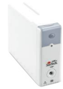
SunTech Advantage NIBP

Fastest response time at the highest sensitivity, unmatched reliability during challenging conditions of motion and low perfusion.