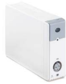
Microstream/ Mainstream EtCO2

Developed based on more than 25 years medical research of BP measurement, according to the clinical test result SunTech Advantage NIBP technology show highly accurate.